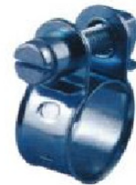
French Type Mini Clamp

Ausführung: Mini Clamp 09-11-W1 verzinkt Freigegebener Lieferant 107212